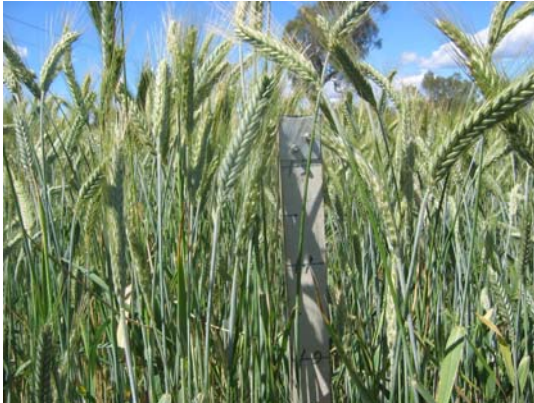
Figure 2. Crackerjack triticale milk - early soft dough