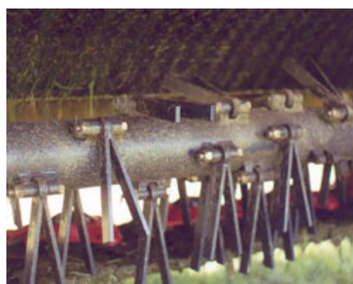
Figure 2. Tyned type mower conditioner

Tyned typed mower conditioners will also increase the rate of wilting through mainly an abrading (bruising) action on the leaves and stems plus some crimping (See Figure 2).