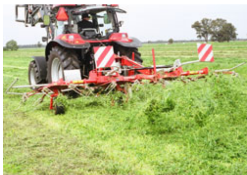
Figure 3. Tedder spreading a pasture crop

Another disadvantage of using a tedder in cereal crops, apart from the extra pass required to do this job, is that the tedder must be set up to avoid the tynes picking up soil while operating. Be aware that the leaves may dry much quicker than the stems if a tedder is used in crops at the later growth stages (grain formation). However, a tedder is very beneficial to respread a crop that has been weather affected.